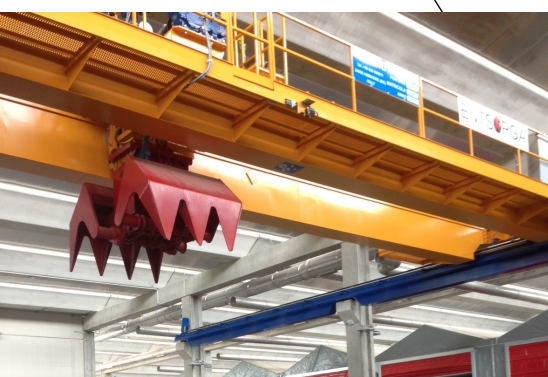
(1) AUTOMATIC BRIDGE CRANE